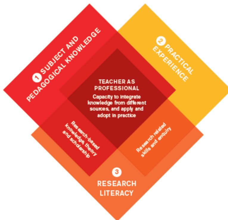
Figure 2: Dimensions of teacher effectiveness and teachers' professional identity.

ProTed's university school concept is adopted by a number of universities. University schools are partnerships between universities and schools that demonstrate excellence in a number of ways (projects, competence, innovative approaches, social relations etc.) They provide a common ground for academia and schools to enter into joint research projects. This does not mean that teachers are expected to be researchers but that they should be able to read, assess and make use of research in order to improve their practice and engage in research where opportunities arise. In many ways, the relationship between knowledge forms and research competence is similar to the illustration offered by the British Educational Research Association :